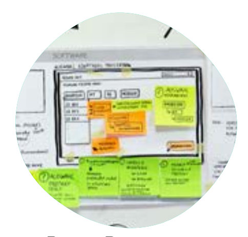
Paper Prototypes Use simple pen and paper to sketch a screen flow of your solution idea.