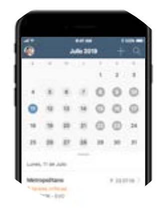
Digital Click-Dummy Create an interactive digital prototype with tools like Figma, Adobe XD or others.