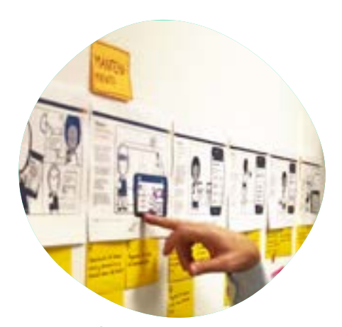
Storyboards Create a Vision Storyboard about your solution idea.